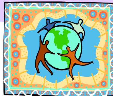
Loving God and neighbor in ways that bear fruit in the life of society.