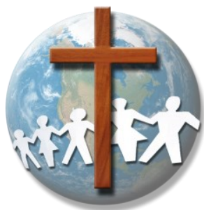
Our office strives to build the capacity of the diocesan Church to act effectively in defense of human dignity, human rights and the pursuit of justice and peace.