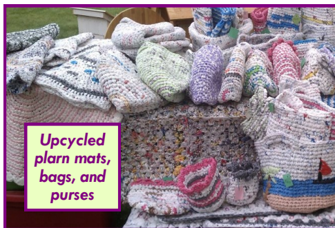
Upcycled plastic mats, bags, and purses

How we organize our society in economics and politics, in law and policy, directly affects human dignity. Marriage and the family are the central social institutions that must be supported and strengthened. People have a right and a duty to participate in society, seeking together the common good and well-being of all, especially the poor and vulnerable.