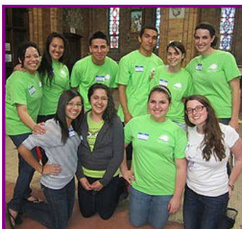
Casa Romero Youth Leaders