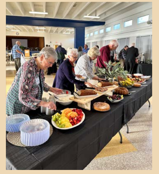
Deacons and their wives enjoy the light breakfast of breads and pastries prepared by the women of St. Gregory the Great Parish.