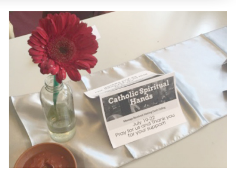
▲ Every table was beautifully set up, while each chair had quotes from various saints.

The Meitner family served a wonderful breakfast to help raise funds for the first Catholic Deaf Family Camp in July.