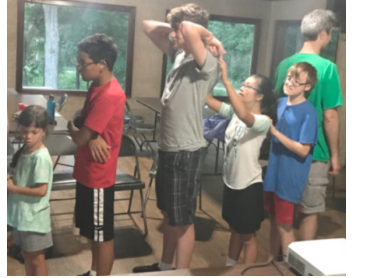
▲ Fun and engaging activities that strengthen the bond of families together and promotes fun fellowship with each other.