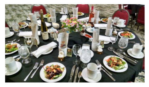
Beautiful set-up for the banquet.