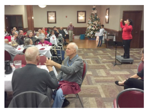
▲ A great turnout during our ICDA #7 Christmas Mass & Lunch at Meyer's Restaurant.