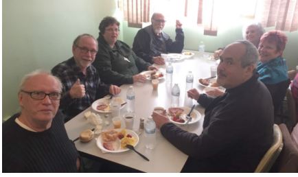
Enjoying our Sunday brunch!