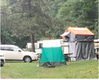
It was a true outdoor Camp experience.