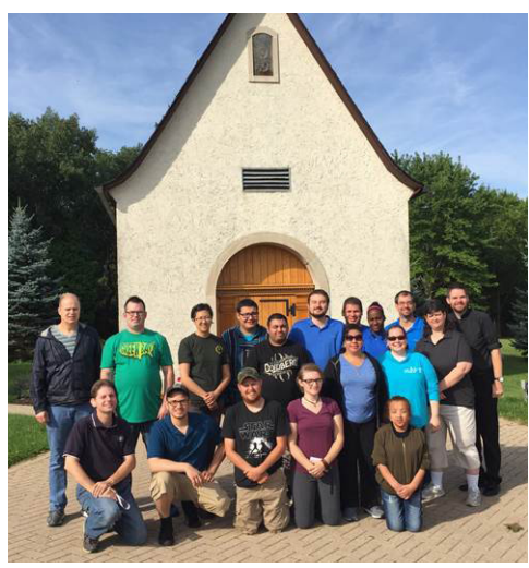
▲ Group Photo of the 2017 Catholic Deaf Young Adults

Wisconsin piece by piece. The interesting part was that Saint Joan of