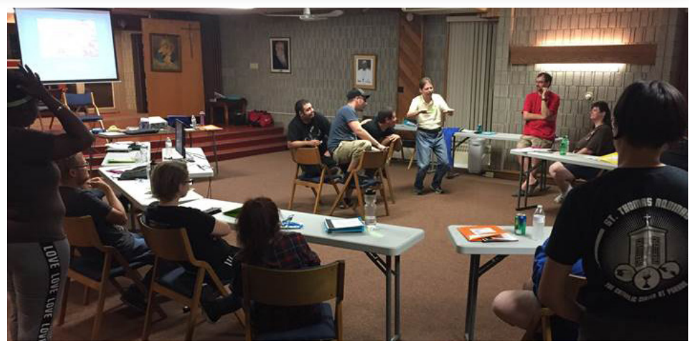
▲ Our retreat weekend was filled with tons of learning opportunities suited to Catholic Deaf Young Adults to grow in the Catholic faith as brothers and sisters in Christ, as well as to learn more about Servant Leadership

I had learned a lot of new things I had no idea about the Catholic Church!