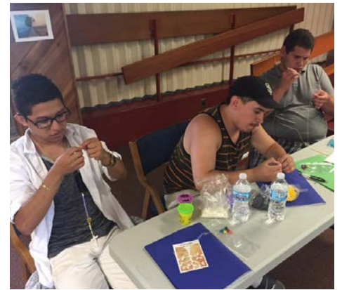
▲ We even had down time to create our own rosaries!