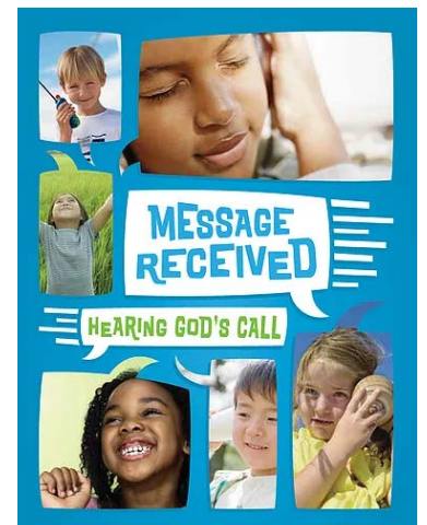
▲ The theme for VBS 2018

It was three full days of camp with various activities that included 5 different sessions along with daily Masses and free times.