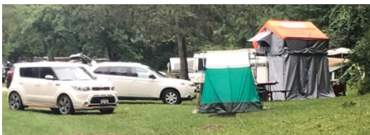
► Green Lake Conference Center campground.