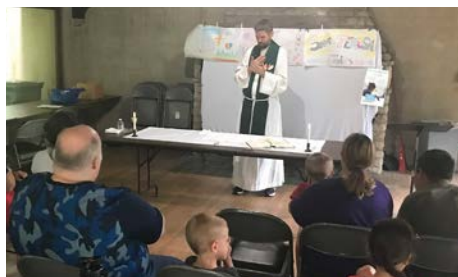
▲ One of our Daily Masses, held at the Tea House.