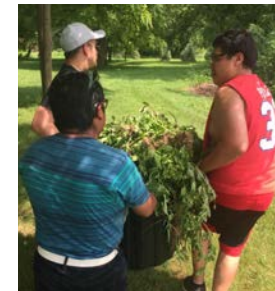
◀ Taking turns to carry the weeds to the Decompost.