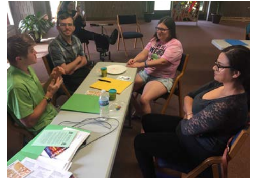
▲ When could we ever have opportunities like this: to share our Catholic faith with others who are also Deaf, Catholic, and Young Adults?