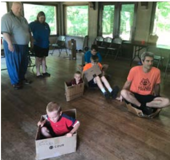
◀ One of the daily activities -- making cardboard boats and testing it.