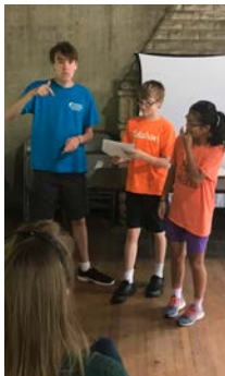
▲ Doing skit based Bible story of Lydia.