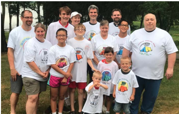
▲ 2018 CSH VBS Camp Group Picture

Hello! Did you hear God's Message? Message heard! - This led to form Catholic Spiritual Hands (CSH)'s vision to set first Catholic Deaf Family Camp at Green Lake, WI during July 19-22 - that included whole family who knows sign language. This is the first Vacation Bible School (VBS) camp for the whole family to have a fun, learning experience.