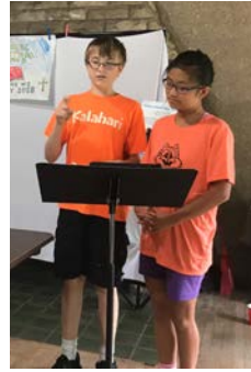
▲ Doing the readings for Mass.