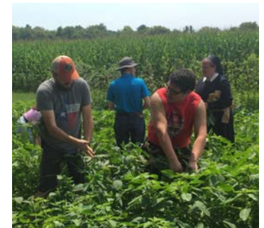
▲ See how the garden is full: you could not tell the difference between the weeds and vegetables.