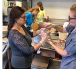
▲ Working hard to sort through foods.