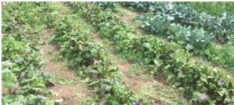
▲ See what a big difference it is now than before? You can see the vegetables!

Sunday, we had closing Mass at the Shrine, and it was GREAT! We learned more about how to pray and about many more young adult saints. We were sad to leave the retreat. I thought it was great and a good weekend full of many great lessons and memories to remember.