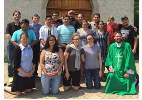
▲ Our group photo in front of the Shrine.