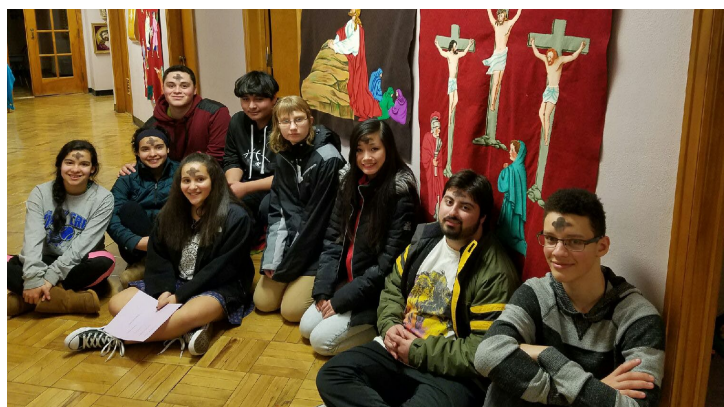
▲ Deaf Religion Education class gather for group picture after receiving their ashes on Ash Wednesday.

playing and visual activities is always educational fun. Some of my favorite memories include reenacting the great flood and getting the animals on the ark. St. Francis befriending Brother Wolf and convincing him to change his mean ways and the villagers forgiving Brother Wolf. Finally making the image of Christ's face on cloth by crayon rubbings and seeing what St. Veronica saw on her veil when she was brave and comforted Christ by wiping his sweaty, bloody face on the road to Calvary.