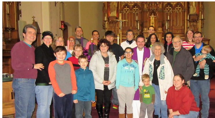
▲ Delavan Deaf Community group picture.

In addition to this part of the curriculum, all the students learned about some fascinating lives of saints; more of God's heroes. These are role models for the kids to look up to and encouraged to emulate their decision to trust God during difficult times and good times. The kids were introduced to St. Juan Diego, St. Francis of Assisi, and St. Veronica. Checking for comprehension for the lesson through role