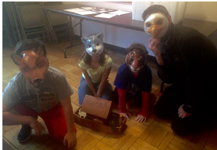
▲ Elementary students become wild animals gathering to board Noah's Ark.