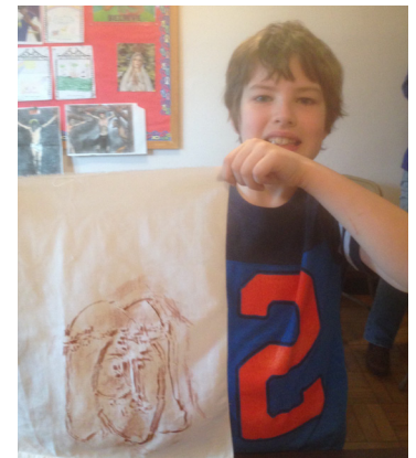
▲ Student holds up St. Veronica's image of Christ's face on a cloth.