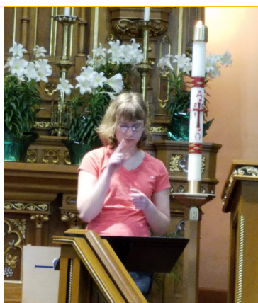
◀ Student signing the reading during Mass.