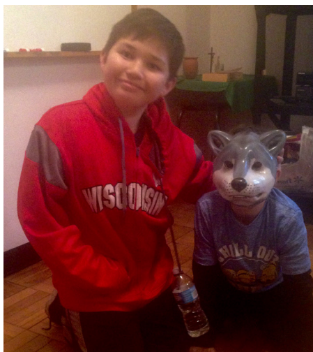
▶ St. Francis and Brother Wolf celebrate forgiveness and peace.

the parish. You might have noticed that for this entire year we have had Deaf adults and students feeling God calling them to proclaim His Good News in ASL through the readings at our Sunday, 9:30 Masses.