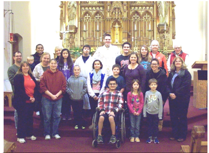
Group photo of students, parents, Deaf adults, and some WSD staff gathered as one, celebrating our faith. St. Andrew, Delavan