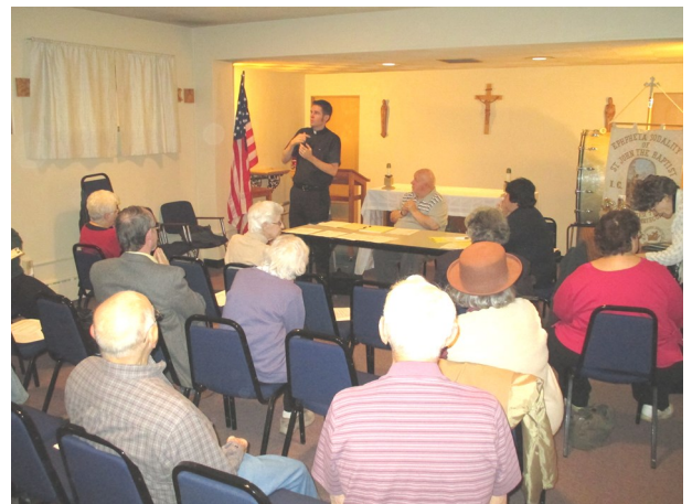
Ephpheta General Membership meeting