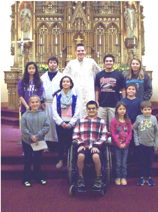
Group photo of kids who celebrated and participated in our All Saints Day Deaf Mass. St. Andrew, Delavan