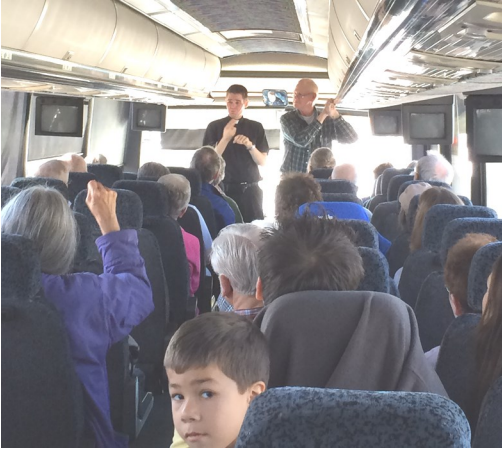
Praying the rosary on the way to the Shrine of Christ's Passion.