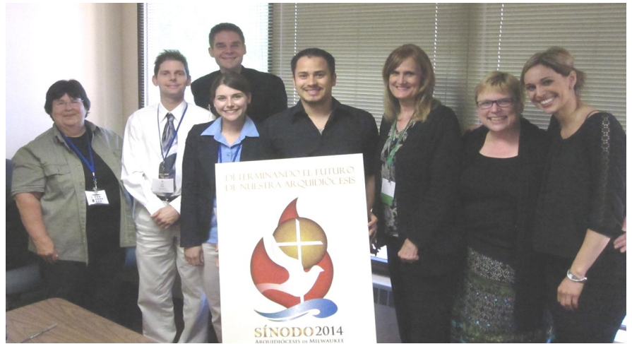
Representing the Deaf and Hard of Hearing community at the Archdiocese of Milwaukee Synod.