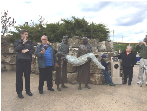
Praying at the 14th Station at the Shrine of Christ's Passion.