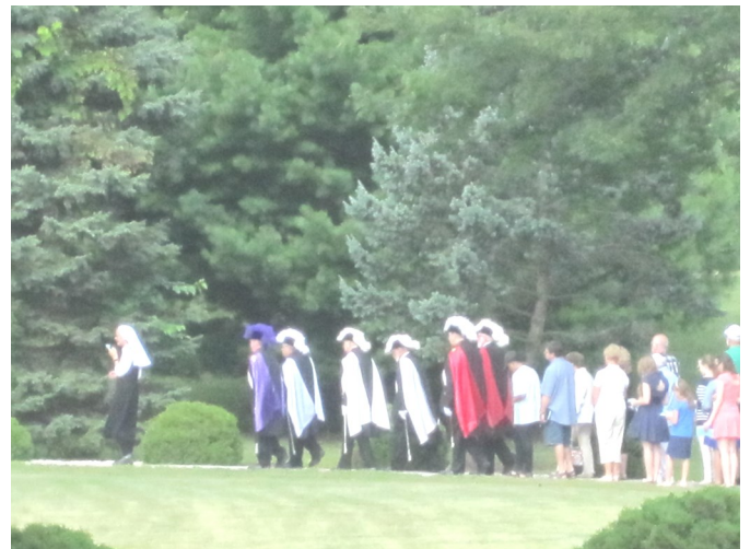
Praying on the beautiful Rosary Walk behind the Sisters of St. Rita Convent in Racine.