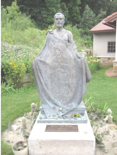
Statue of St. Juan Diego at the Shrine of Our Lady of Guadalupe in La Crosse.