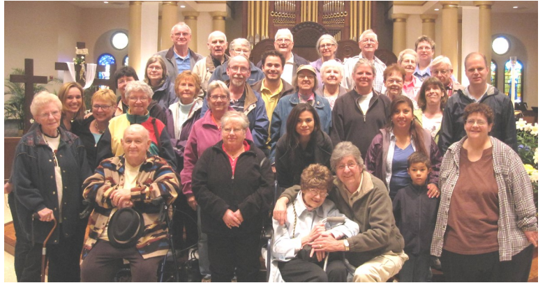
Pilgrimage to the Shrine of Christ's Passion. After Mass at St. John the Evangelist Church.