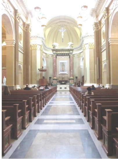
Beautiful Chapel at the Shrine of Our Lady of Guadalupe in La Crosse.