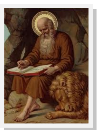
St. Jerome, Patron Saint for Interpreters, Pray for us!

RSVP by June 27, 2013 or August 1, 2013 to: matenaert@archmil.org