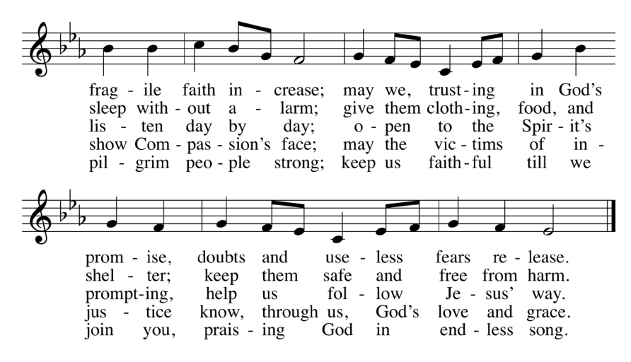
Text Copyright © 2011 by GIA Publications, Inc. • All Rights Reserved Reprinted with permission, OneLicense.net A-703575.