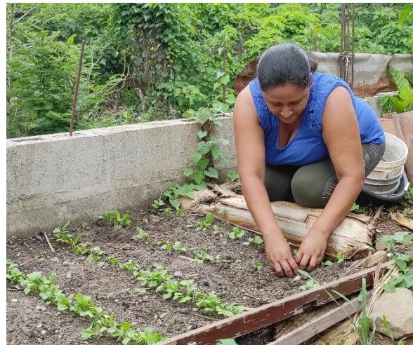
woman taking care of her radish crop

On the other hand, the SHARE Foundation and CCR are working at the launch of the campaign "Sowing Seeds of Hope" in order to benefit 300 women from the organized communities with kits for organic production, the kits include training, seeds for the garden, and basic agriculture tools.