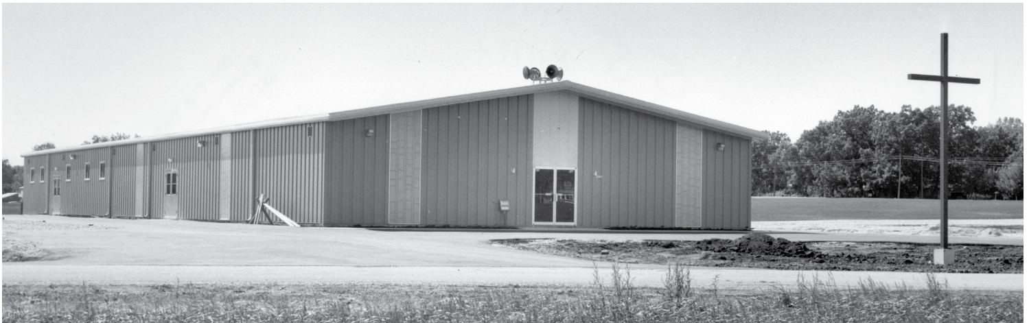
▲ St. Clare Parish, Wind Lake, photo taken in 1969, original church building