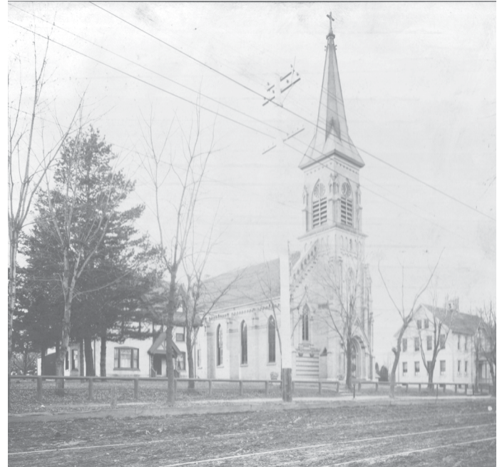
▲ St. Patrick Parish in Thompson (Erin), photo taken in 1917.