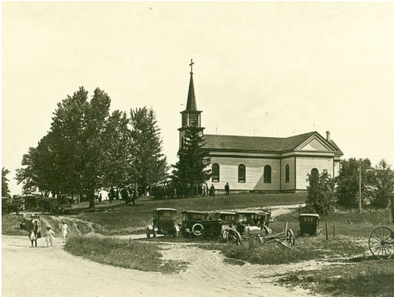
▲ Sacred Heart of Jesus Parish in St. Francis, photo date unknown