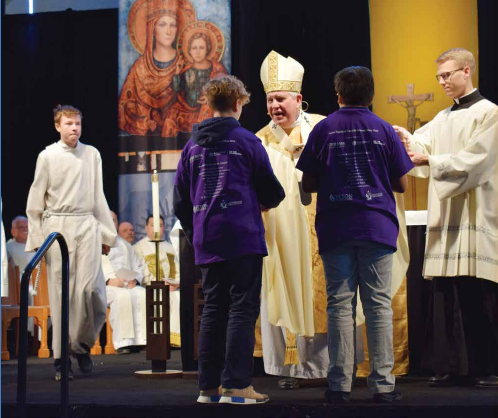
The Most Reverend Jerome E. ListECKi Archbishop of Milwaukee

Today more than ever, each aspect of a Catholic school—from daily prayer to formal religious instruction, core academics to extra-curriculars—must work together as we form young men and women to be disciples of Jesus Christ.