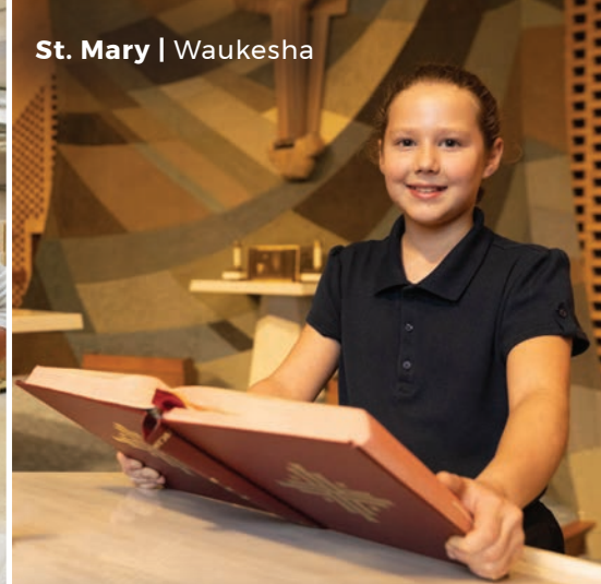
St. Mary | Waukesha