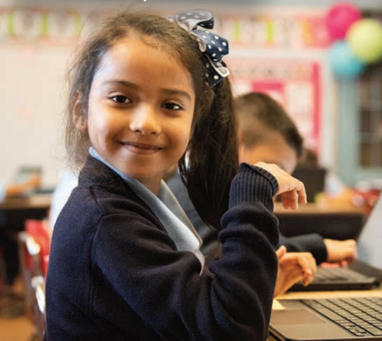
St. Adalbert | Milwaukee