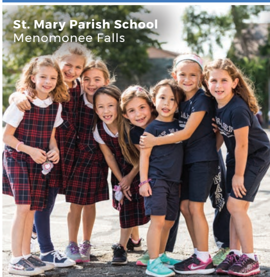
St. Mary Parish School Menomonee Falls